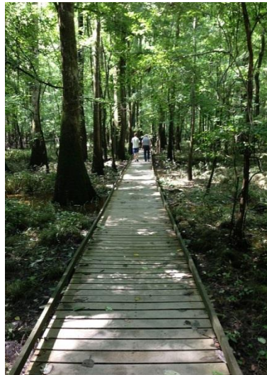
Congaree National Park